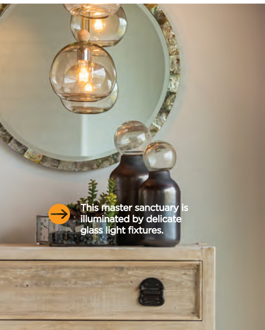
→ This master sanctuary is illuminated by delicate glass light fixtures.