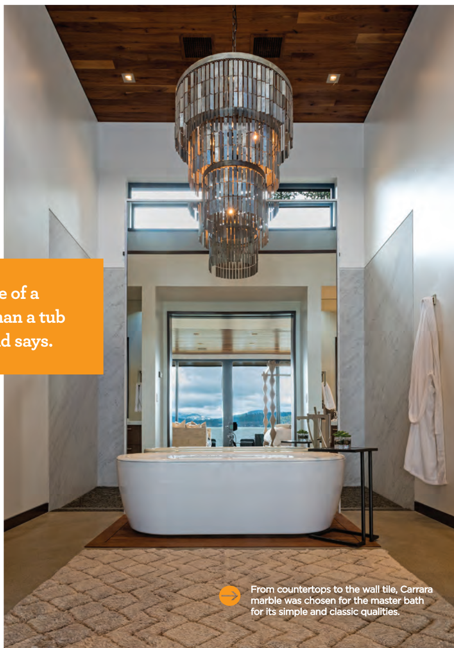
→ From countertops to the wall tile, Carrara marble was chosen for the master bath for its simple and classic qualities.

Dramatic yet calming, this is one master sanctuary you wouldn't ever want to leave. N