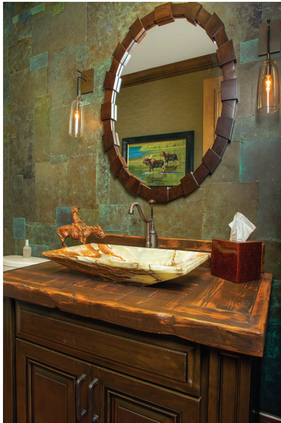
A custom copper treatment on the bathroom wall and the raised stone sink make even the bathroom an exquisitely designed room that is visually exciting.

homeowners enter from the adjacent three-car garage. Just down the hall, a flight of carpeted stairs leads up to a guest studio apartment, which is fully outfitted with a kitchenette, its own bathroom, and plenty of sleeping and living space.