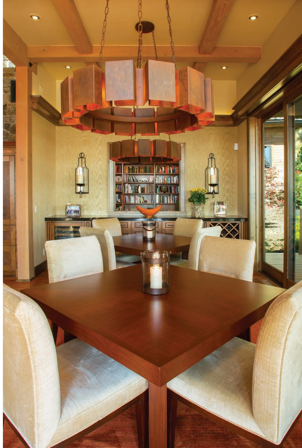
These two dining tables can be put together for larger parties. The pass-through in the background opens into Barbara's office.

that are suspended from the box beam ceiling; these tables can be pushed together to create space for a larger group if desired. Cabinetry built in along one side of this room provides serving space as well as storage; there's also a wine cooler here. A pass-through window connects to Barbara's office, just behind this dining area, which has water views, a built-in desk and bookcases, and plenty of workspace.