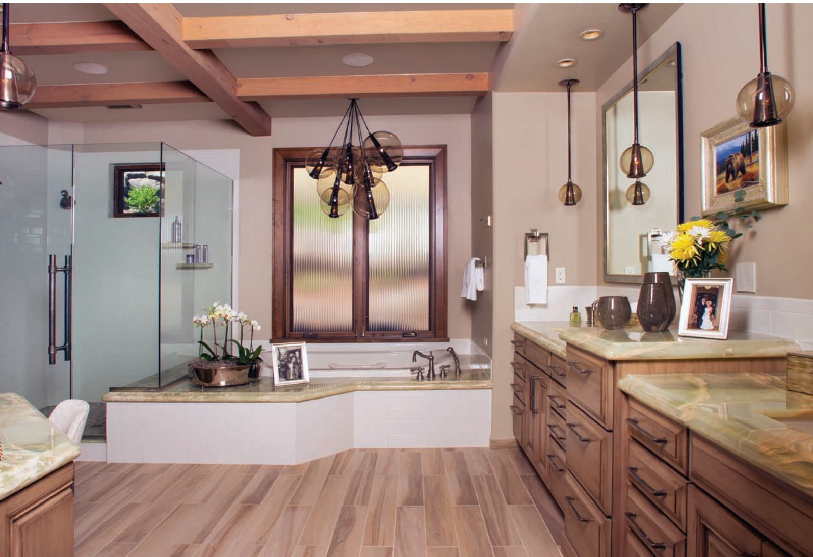
Lighter toned cabinetry is used in the master suite, setting it apart from the rest of the house.