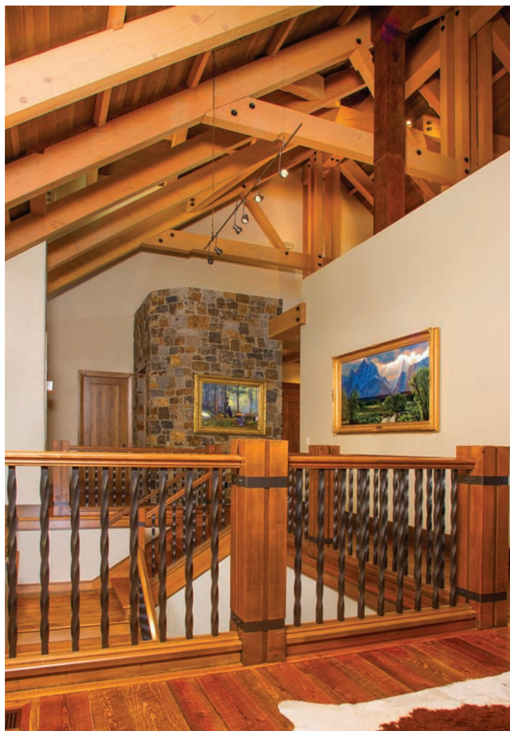
Exposed beams are functional and stylish.

Stairs from the upper terrace and doors from the lower level all lead to the lower patio, the grassy lawn, and the beachfront. On the beach there's room for the couple's "toys" like a jet ski, sailboat, paddleboard, kayaks, and a canoe, in addition to dock space for Jim's seaplane, which