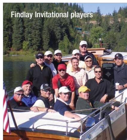
Findlay Invitational players

“Since the summers in Coeur d’Alene are fairly dry with little humidity, we don’t have to battle insects. Also, with the elevation at only 2,000 feet, you need not worry about adjusting to the altitude which can be an issue for people with heart conditions. Another plus is the temperature of the lake. The water warms up to a perfect temperature in July and August making it ideal for swimming and water skiing. It is much warmer than Lake Tahoe!”